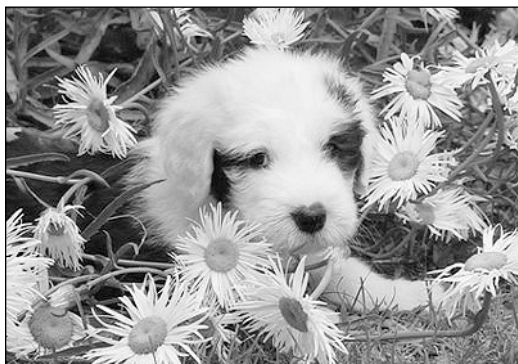
Old English Sheepdog: 6 weeks

Please pass this flyer on to friends and your veterinarian.