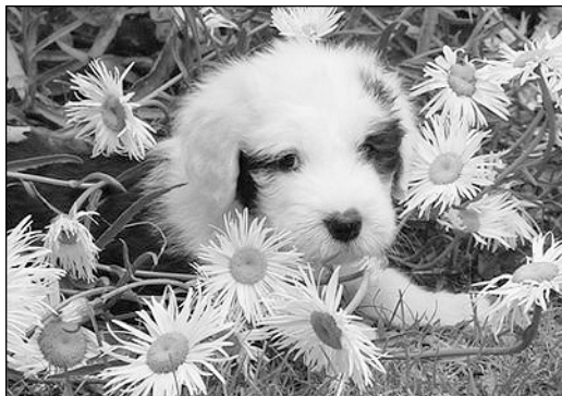
Old English Sheepdog: 6 weeks

As breeders, it is our responsibility to preserve form and function in our breeding programs. These programs abide by a breed standard outlining conformation and temperament, and designed to ensure the dog's ability to work as it was designed. This flier will help you understand why your puppy had any one or all of these procedures.